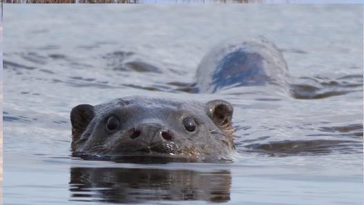
The otter, curious, but on guard.

Local area around the river Skjern Å delta