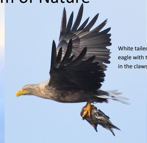
White-tailed eagle with teal in the claws